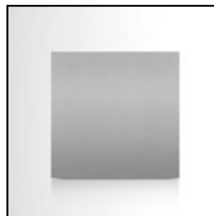
Angle: Overhead Viewpoint: Plan