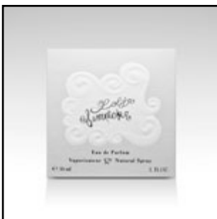
Angle: Camera Level Viewpoint: Front