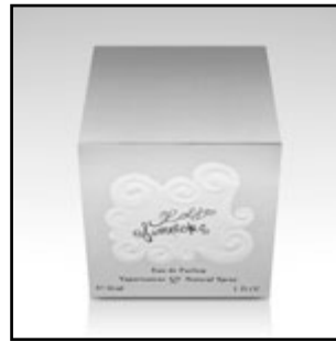
Angle: 30° Overhead Viewpoint: Front