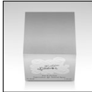
Angle: 60° Overhead Viewpoint: Front