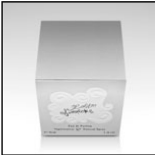
Angle: 45° Overhead Viewpoint: Front