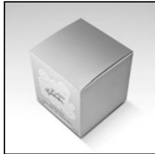
Angle: 45° Overhead Viewpoint: Side