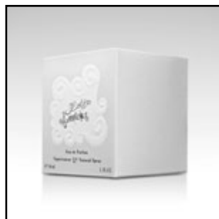
Angle: Camera Level Viewpoint: Side