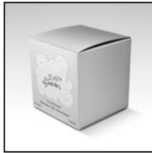
Angle: 15° Overhead Viewpoint: Side