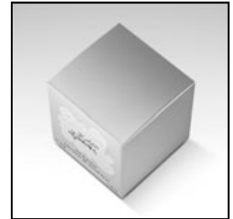
Angle: 60° Overhead Viewpoint: Side