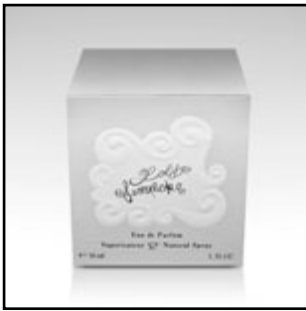
Angle: 15° Overhead Viewpoint: Front