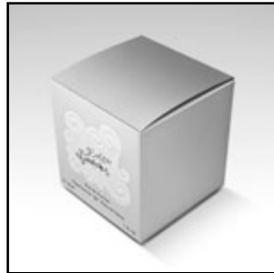
Angle: 45° Overhead Viewpoint: Side